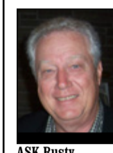
ASK Rusty Social Security Advisor

Dear Skeptical: Well, your question is clear but contains two opposing factors - you say you wish to provide well for your wife if you die, but also