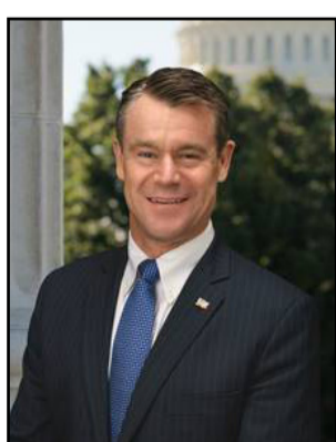
Senator Todd Young

U.S. Senators Todd Young (R-Ind.) and Cory Booker (D-N.J.) applauded the passage of their Emergency Savings Act by the U.S. Senate Health, Education, Labor & Pensions (HELP) Committee on Tuesday, as part of S. 4353, Retirement Improve-