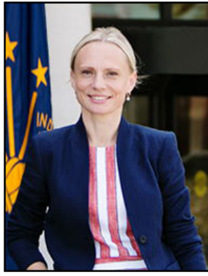
Rep. Victoria Spartz

ments residing in Indiana's Fifth Congressional District to apply for upcoming class nominations. Applications must be filled out online at https://spartz.house.gov/services/military-academy-nominations and submitted no later than October 14, 2022, to: SpartzAcademyNominations@mail.house.gov .