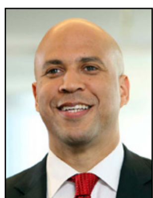
Senator Cory Booker (D-N.J.)

U.S. Senators Todd Young (R-Ind.) and Cory Booker (D-N.J.) applauded the passage of their Emergency Savings Act by the U.S. Senate Health, Education, Labor & Pensions (HELP) Committee on Tuesday, as part of S. 4353, Retirement Improve-