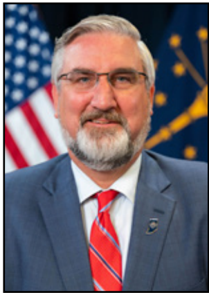
Governor Eric Holcomb

Earlier this week, Indiana Gov. Eric Holcomb honored six African American Hoosiers for their exceptional efforts across diverse fields—including education, entrepreneurship, and civil rights—at the Governor's Awards Reception, held in conjunction with the 51st Indiana Black Expo Summer Celebration. The reception acknowledges the outstanding achievements of African Americans throughout the state.