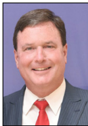
Attorney General Todd Rokita

Rokita's office had previously secured a stay of injunctions barring enforcement of requirements that only physicians may provide medication abortions; that second-trimester abortions may only be performed in hospitals or ambulatory surgical