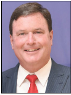
Attorney General Todd Rokita

JUUL has an option to pay over 6-10 years — with the total payout increasing the longer it takes to pay. If JUUL chooses a 10-year option, Indiana’s amount would exceed $17.1 million. JUUL’s first payment