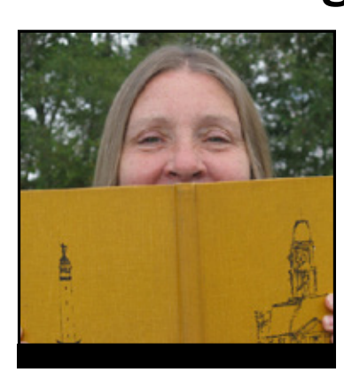
COLUMNIST NAME Column Name

Attention bird watchers — it's almost time for the Christmas Bird Count!