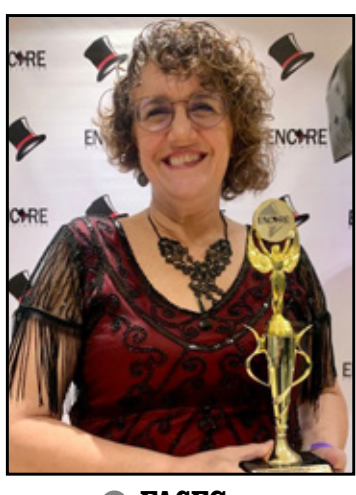
⇒ FACES OF HAMILTON COUNTY

Psalm 23:1 The LORD is my shepherd; I shall not want.