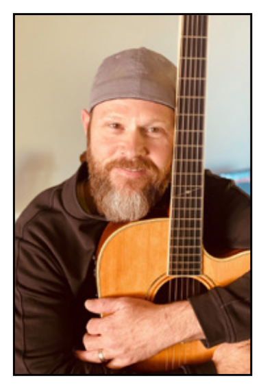
FACES of HAMILTON COUNTY

John 8:32 And ye shall know the truth, and the truth shall make you free.