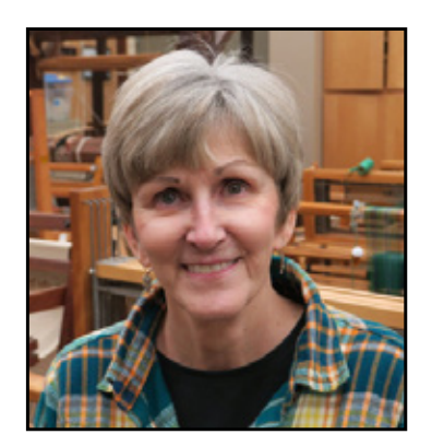
FACES OF HAMILTON COUNTY

Psalm 16:8 I have set the LORD always before me: because he is at my right hand, I shall not be moved.