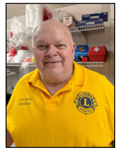
FACES OF HAMILTON COUNTY

Acts 2:38 Repent, and be baptized every one of you in the name of Jesus Christ for the remission of sins, and ye shall receive the gift of the Holy Ghost.