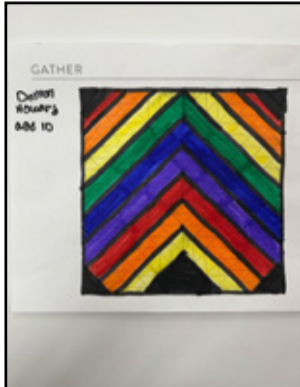
Damon Howard, 10