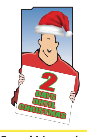
Brought to you by: