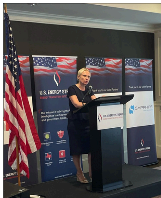
Rep. Victoria Spartz of Noblesville traveled to Texas to be a guest speaker at the U.S. Energy Forum hosted at the Petroleum Club of Houston with the goal to have a thoughtful conversation between the business community and policymakers on energy transition, stability, feasibility and sustainability. "Smart energy policies are key for a strong economy and stability around the world," Spartz said. "Congress needs to put everything on the table and on the menu, and have a serious discussion on energy policies, not politics, which can bring tremendous growth to our economy and improve global security."