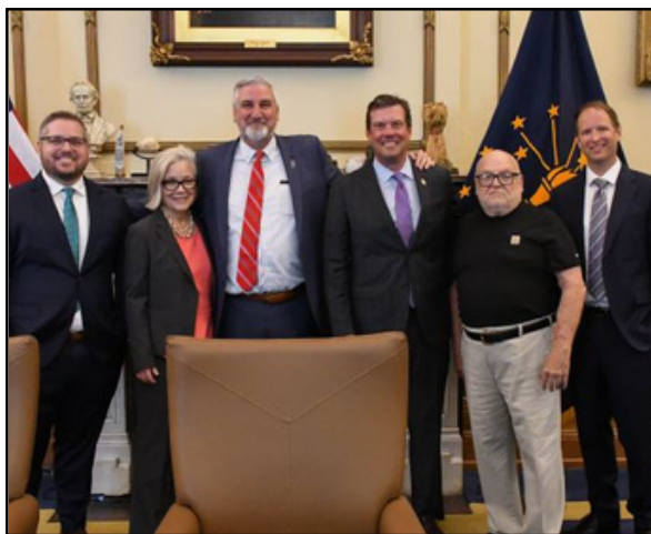
Last week, Gov. Eric Holcomb ceremonially signed Senate Enrolled Act 215.