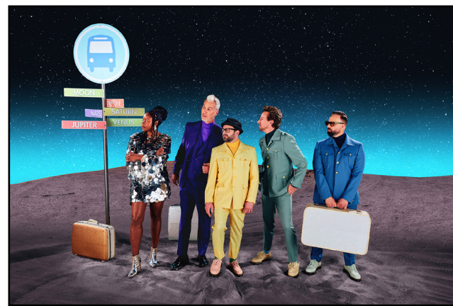
Fitz and The Tantrums – Aug. 6