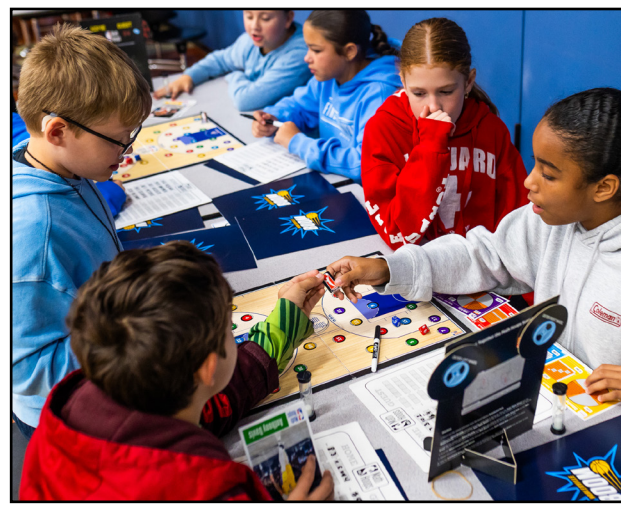
Hinkle Creek Elementary School fifth-grade students participate in the NBA Math Hoops program, hosted by the Pacers Foundation in partnership with the Noblesville Boom, on Thursday, Sept. 11, 2025, in Noblesville.