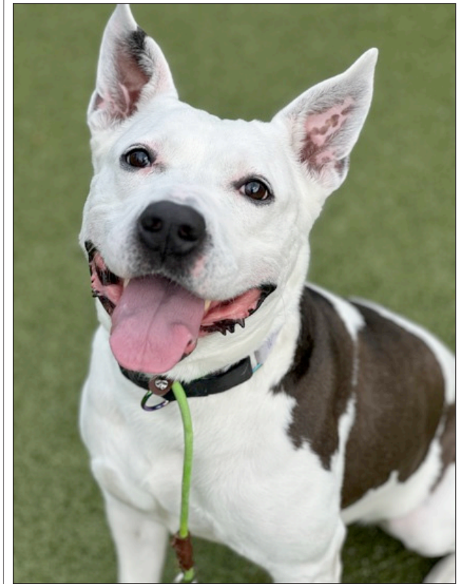
The American Pit Bull Terrier was chosen to embody the strength and loyalty of America’s military during the World Wars.

Every March, HSHC hosts Pit Bull Education Month, a campaign that touches every aspect of HSHC’s mission - saving lives, educating communities, and completing families. “Pit Bulls” have faced going on four decades of stigmatization, discrimination, and, in many cases, unthinkable abuse. HSHC’s social media outreach this month will share the facts vs. fiction when it comes to proving these dogs, once considered “America’s Dog,” still deserve to be.