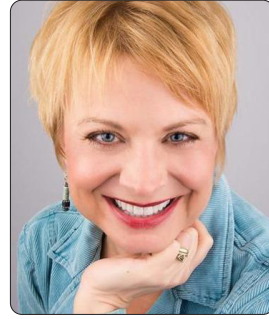
CARRIE CLASSON The Postscript