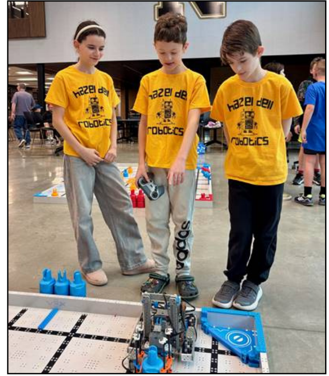
This ranking places Noblesville in an elite, top 1 percent group nationally.

grams. To be eligible for the designation, schools had to offer a variety of PLTW STEM courses and have a significant portion of students participating in them, while students had to demonstrate mastery in the content and ongoing continuation in the programming.