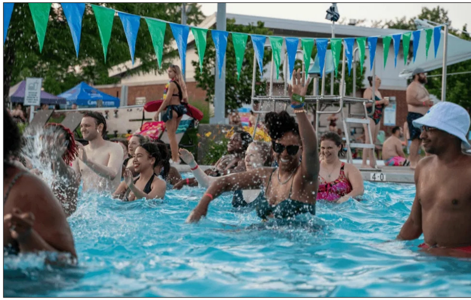
Monon Mixers offer those 21 and over exclusive after-hours access to The Waterpark's attractions, along with alcoholic beverages from local vendors.