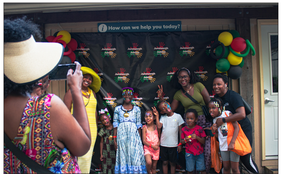
Last year, more than 2,000 individuals enjoyed the Jubilee with their families.

Fishers High School’s Fishers Black Leaders Club, with support from Fishers Arts Council and Conner Prairie, are presenting the 7th Juneteenth Jubilee at Conner Prairie from 5-8 p.m. on Friday, June 19. This free-to-the-public annual student-managed event features Black owned businesses, visual artists, culinary artists, community resources, as well as talented performing artists.