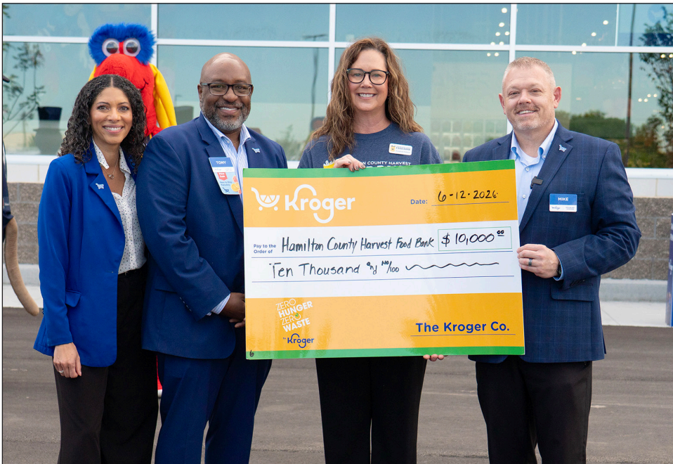
Kroger presented a check to Hamilton County Harvest Food Bank for $10,000.